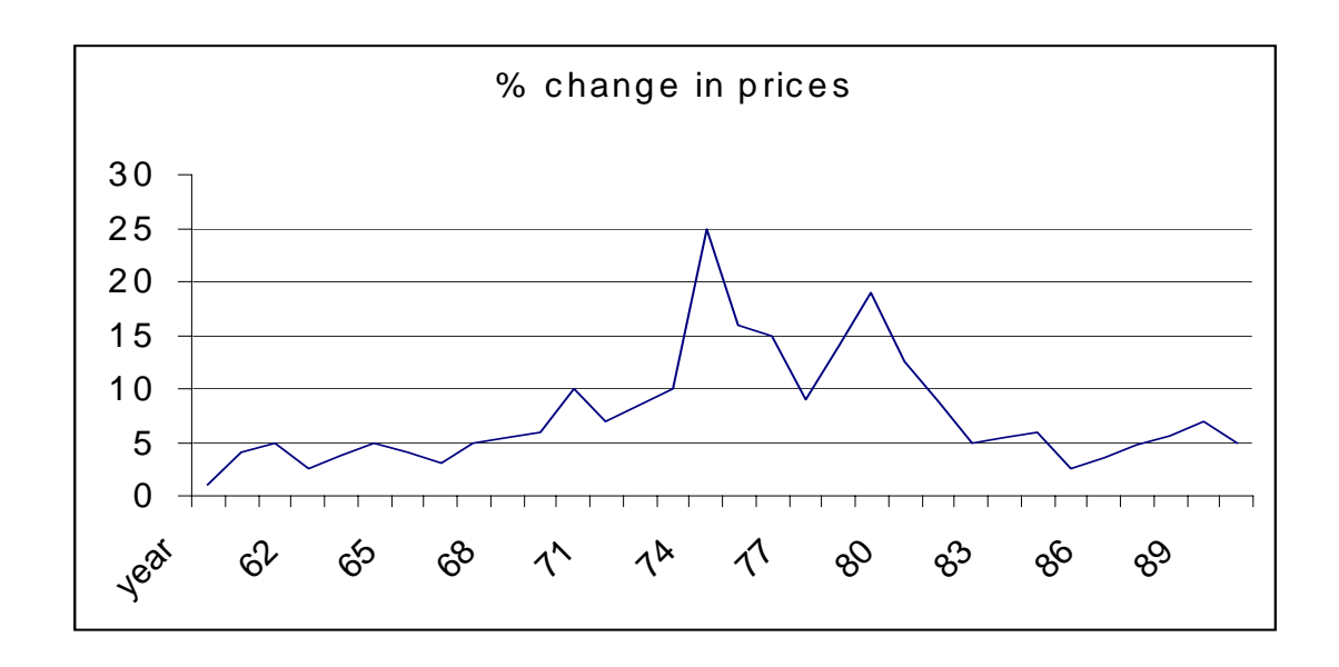
THE EFFECTS OF INFLATION